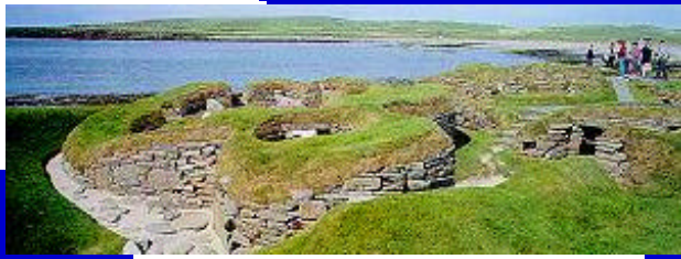
The prehistoric village at Skara Brae