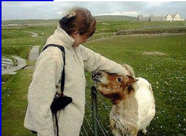
Sara befriends the locals