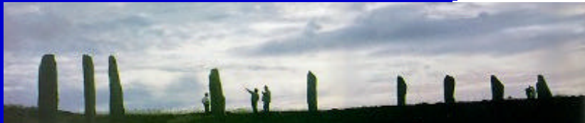
Orkney's most revered stone circle: the Ring of Brodgar