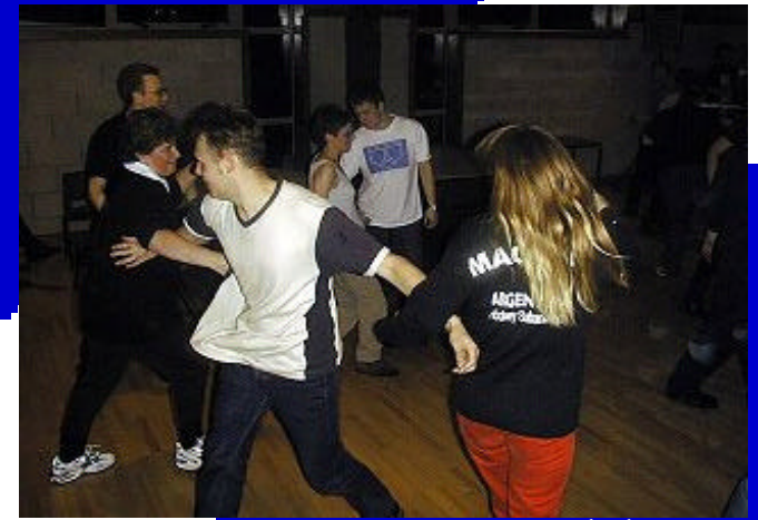
Getting down to some serious Ceilidhing!